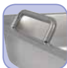
Patented Handle System