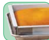
Make sheet cakes without cake pan