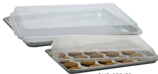
CXP-SERIES (sheet pan not included)