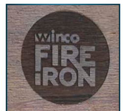
Engraved logo on bottom