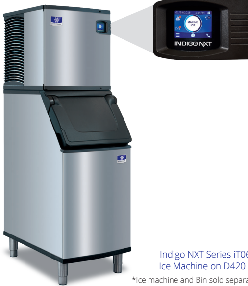
Indigo NXT Series iT0620 Ice Machine on D420 Bin