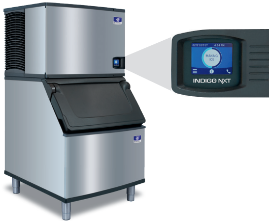
Indigo NXT Series iT0450 Ice Machine on D400 Bin

Designed for operators who know that ice is critical to their business, the Indigo NXT Series ice machine's preventative diagnostics continually monitor itself for reliable ice production. Improvements in cleanability and programmability make your ice machine easy to own and less expensive to operate.