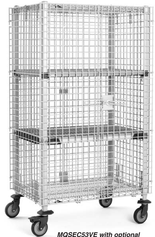
MQSEC53VE with optional intermediate shelves

Note: Leveling foot on post can be adjusted up to 1" (25mm) to compensate for uneven floors.