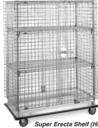
Super Erecta Shelf (HD Mobile) with optional Super Adjustable Super Erecta® Intermediate shelves