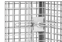
Ergonomic 1/4-turn door handle

VE models use two 5PCX and two 5PCB casters.