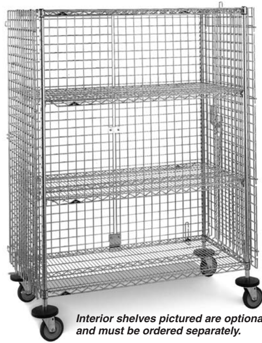
Interior shelves pictured are optional and must be ordered separately.