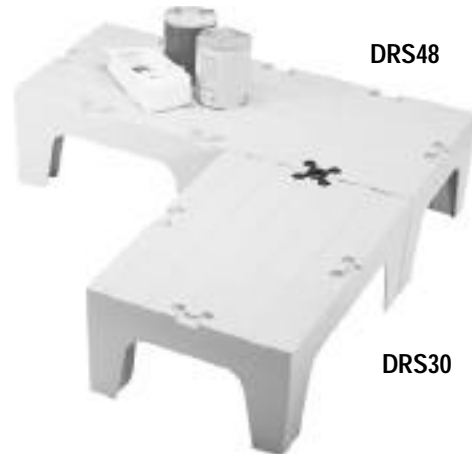
S-Series Solid Top Dunnage Racks