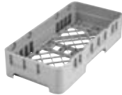
HBR = Half Size Base Rack