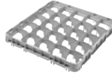
E4 = Full Size Full Drop Compartment Extender