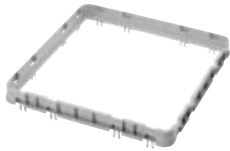
E3 = Full Size Open Extender