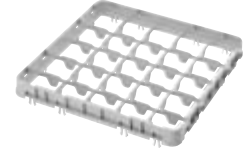
E2 = Full Size Half Drop Compartment Extender