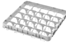
E1 = Full Size Full Drop Compartment Extender