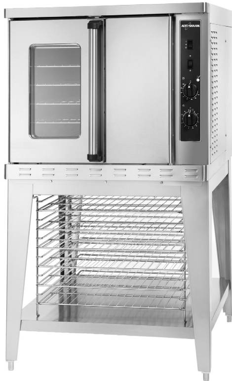
ASC-4G With optional stationary oven stand and pan rack with shelves - 5003489