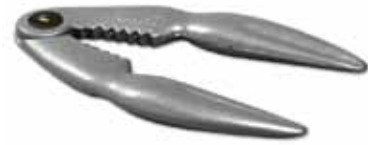
LOBSTER CRACKERS Cast aluminium covered with special coating for dishwasher.