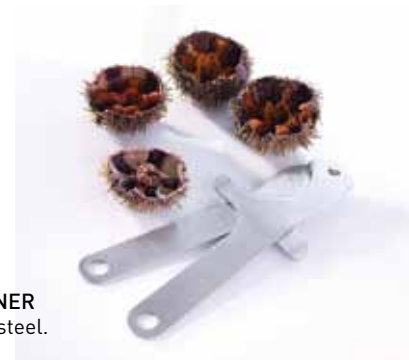
SEA URCHIN OPENER Made of stainless steel.