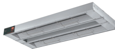
GRA-36D with standard 3" spacer

NOTE: 120V models may require additional switches.