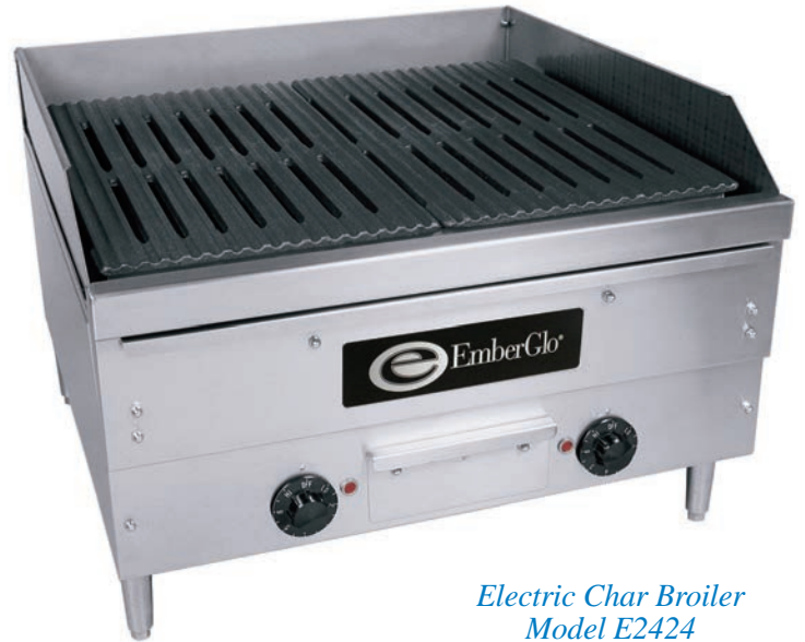
Electric Char Broiler Model E2424