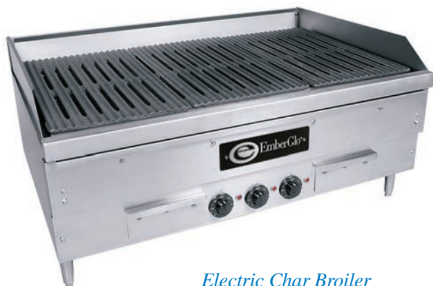
Electric Char Broiler Model E2436