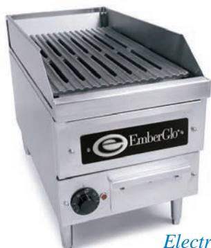
Electric Char Broiler Model E2412

Each 12" EmberGlo broiling module uses 3 kW of electrical capacity (208 or 240 VAC, single or 3-phase current) subsequently, the 36" EmberGlo electric broiler requires only a 9 kW capacity. Install a dependable and profitable charbroiling system in small spaces using the E2412 or use the same basic system and expand to fit a space of two, three or even ten or more feet wide for larger restaurants and chain operations which demand extraordinary cooking capacity. Whether you want to increase your broiling in a big way or just add a little variety to your menu, there is a place in your operation for the new E24 Series Electric Broiler from EmberGlo.